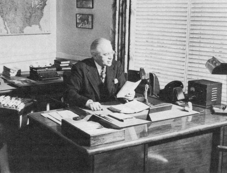
PHOTO SHOWS Herbert W. Armstrong making an early World Tomorrow radio broadcast. From the smallest beginnings, God's work has grown to international scope, carrying the true gospel to all the world as a final end-time witness.

That was Jesus' gospel. Notice the gospel which Jesus proclaimed.